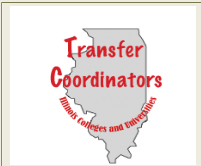
Transfer Coordinators' logo